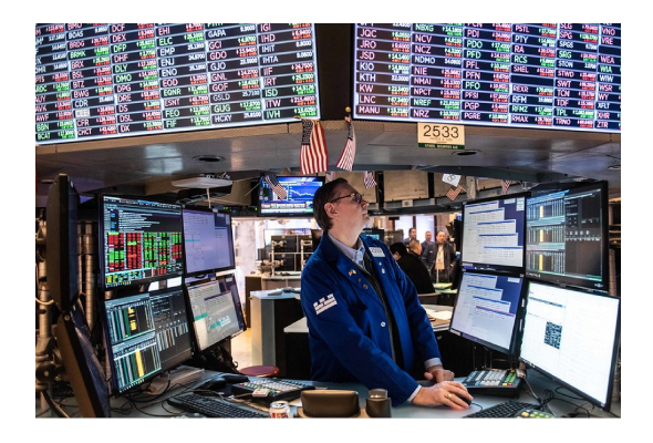
THE CITY THAT NEVER SLEEPS, SLEEPS- Experts Analyze Future of New York's Central Business Districts

Air-One, which opened in the West Midlands city on Monday, claims to be the world's first hub for flying taxis. Read more.