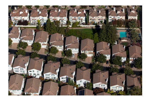
MO SAY NO TO HOMES- Record-Low Share of Americans Say It's a Good Time to Buy a Home

This is the first time since in the Gallup survey's history that the overall poll shows people say now a bad time to buy. Read more.