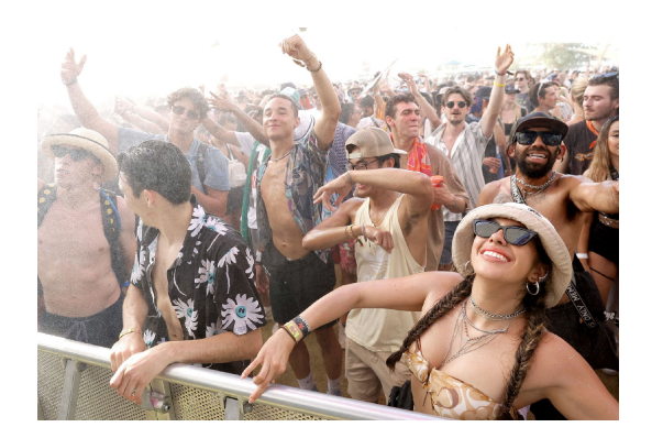
PARTY LIKE IT'S 2019- American Consumers Are Shopping, Traveling, and Working Out Like It's 2019

Home-sharing giant expects to post its first full-year profit this year. Read more.