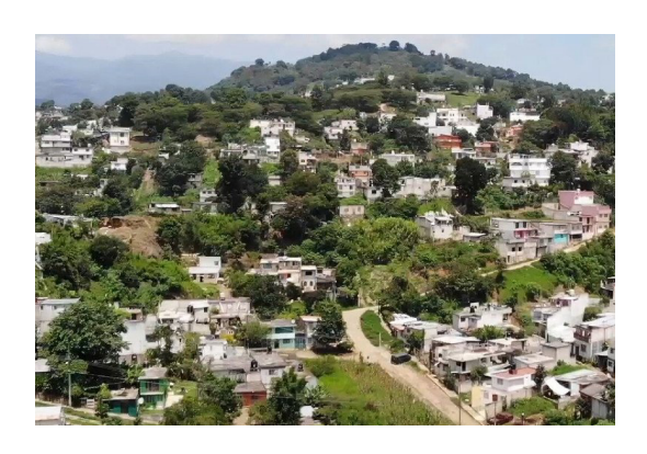
UNITED NATIONS BACKS URBANIZATION- General Assembly reviews global progress towards sustainable urbanization

Design plans for the development show three interconnected platforms built withstand storms and rising sea levels. Read more.