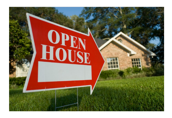
RATES RISE, SALES FALL- Rising Mortgage Rates Starting to Affect Residential Housing Market

This is the first time since in the Gallup survey's history that the overall poll shows people say now a bad time to buy. Read more.