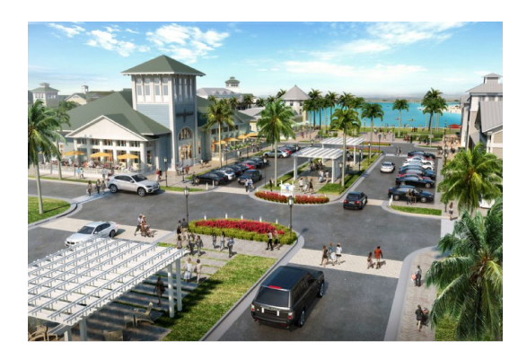
MASTERING MASTER PLANS - What Is a Planned Unit Development?

Design plans for the development show three interconnected platforms built withstand storms and rising sea levels. Read more.