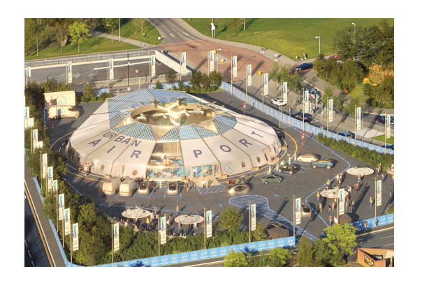
FLYING CABS AT VERTICAL PADS-'World first' Airport for Flying Taxis Opens...in a Coventry Car Park

Air-One, which opened in the West Midlands city on Monday, claims to be the world's first hub for flying taxis. Read more.