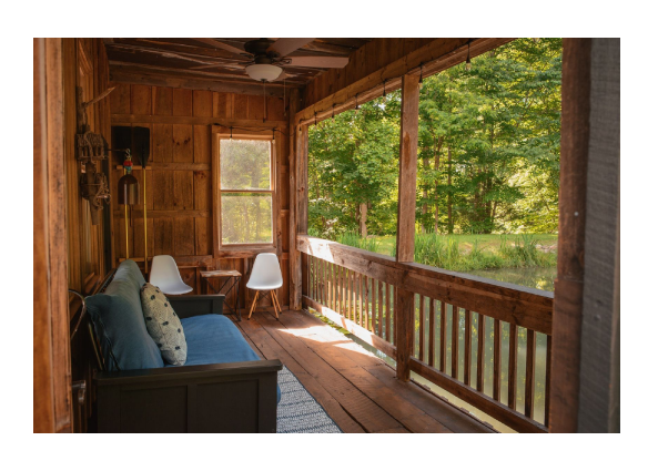
BOOKING SPREE AT AIRBNB- Airbnb Revenue Climbs on Record Nightly Bookings and Higher Prices

Home-sharing giant expects to post its first full-year profit this year. Read more.