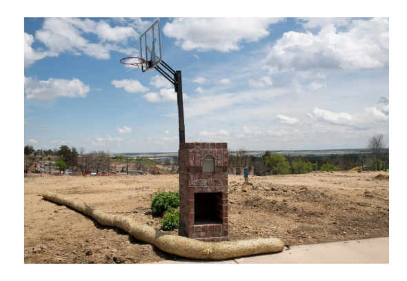
OVENERS MOOT STAYING PUT- When the Best Available Home Is the One You Already Have

The housing market has altered the math of moving for nearly everyone. Read more.