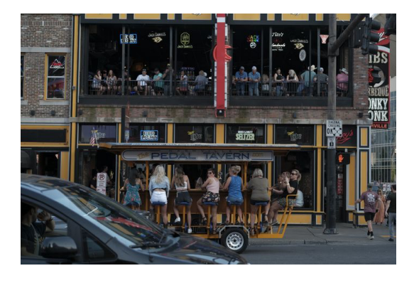
NASHVILLE BOOM CAUSES INFLATION GLOOM- Housing, Child Care, Utilities—Nashville Faces Exceptional Inflation Hit From All Sides

Connections between major highways, a walkway and two groundwater projects were under consideration, documents show. Read more.