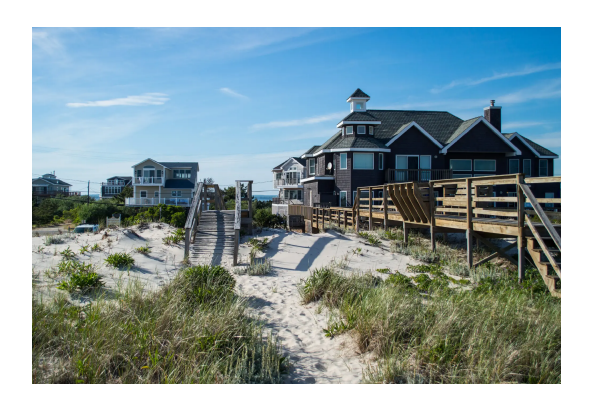
HAMPTON RENTALS WANE AS PRICES GAIN CAUSES PAIN- Owners of Ritzy Hamptons Homes are Slashing Prices for Summer Rentals by as Much as 30%

The housing market has altered the math of moving for nearly everyone. Read more.