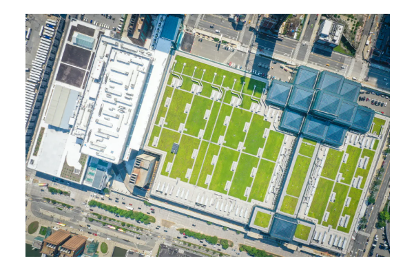
ROOFTOPS GREEN TO BEAT THE HEAT- NASA Explores Potential for Green Roofs to Lower Temperatures in Cities

Research undertaken by NASA has found that rooftop gardens can offer substantial temperature reductions in cities during summer months. Read more.