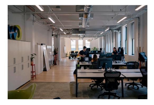
WITH EMPLOYEES FOCAL, NYC OFFICES GO LOCAL- NYC Companies Are Opening Offices Where Their Workers Live: Brooklyn

Urban areas where people live closer to work have a higher return-to-office rate, WSJ analysis shows. Read more.