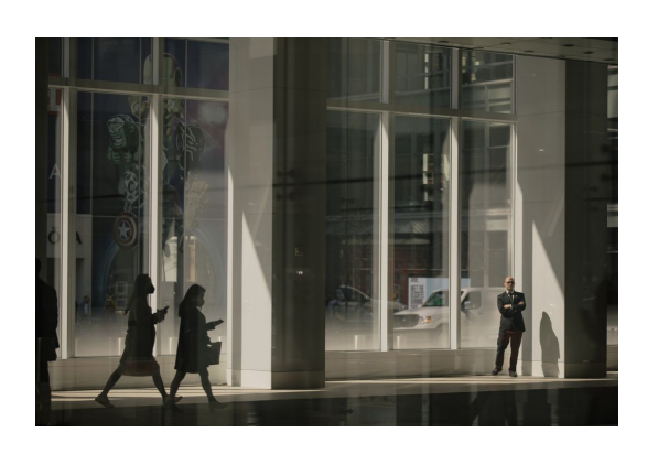
COMMUTERS SPURN OFFICE RETURN- Dreaded Commute to the City Is Keeping Offices Mostly Empty

Urban areas where people live closer to work have a higher return-to-office rate, WSJ analysis shows. Read more.