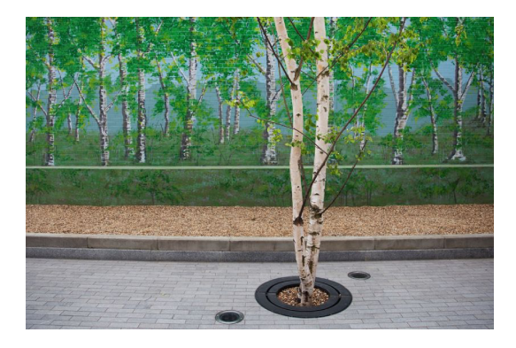
FOR CITY TREES, THE NAME IS PLANE- How a Hybrid Tree Conquered the World

Research undertaken by NASA has found that rooftop gardens can offer substantial temperature reductions in cities during summer months. Read more.