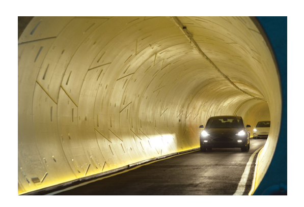
MUSK'S BORING CO IS BORING TUNNELS- Elon Musk's Boring Co. Pitched Texas on Tunnels for Cars, People, and Water

Connections between major highways, a walkway and two groundwater projects were under consideration, documents show. Read more.