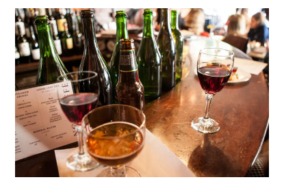
VITALITY IN HOSPITALITY - Bars, Hotels and Restaurants Become the Economy's Fastest-Growing Employers

There are several decent answers as to why—and none of them point to an easy time for investors. Read more.