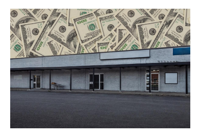
CRE STRATEGIES FOR 2023 -Distressed and Opportunistic CRE Funds: Explained

With liquidity drying up and interest rates high, investors should decrease equity risk and pocket gains while the current stock rally is still going. Read more.