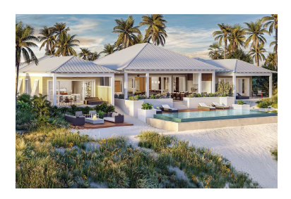
HOTEL-BRANDED DIGS THRIVE IN MARKET DIVE - Hotel-Branded Residences Thrive During Housing Market Downturn

Buyers snatch up homes connected to luxury hotels and branded stand-alone properties. Read more.