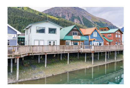
RATES AGGRAVATE REAL ESTATE -The U.S. Housing Market Is Crumbling Under the Weight Of Higher Mortgage Rates And Rock-Bottom Affordability

Single-family home prices slid 1% in January, as compared to December 2022, according to data from Moody's Analytics. Read more.