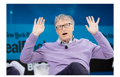
NUCLEAR FISSION IS BILL GATES' VISION - Bill Gates: Asking People to Stop Eating Meat Won't Fix Climate Change

A new way of sucking carbon dioxide from the air and storing it in the sea has been outlined by scientists. Read more.