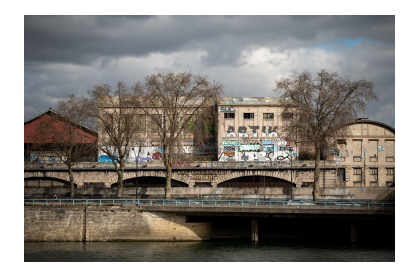
END OF TIME FOR "FRIDGE" FOR WINE - Last 'Frigo' in Paris: Urban Plan Threatens Piece of City's History

Local leaders across the nation are overhauling parking requirements for developers, scaling back the minimum number of spots for shopping centers and apartment complexes. Read more.